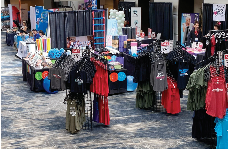
Exhibit at MANIA® and reach influential fitness pros with enormous buying power and consumer influence. This is ideal for new product sampling and program exposure!